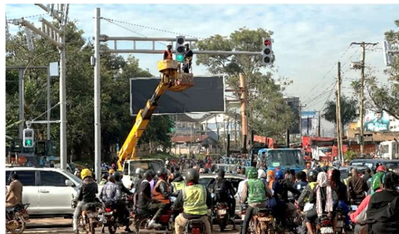
On-site installation of signal control equipment (Equipment delivered by our company)

*MODERATO: An abbreviation of Management by Origin-Destination Related Adaptation for Traffic Optimization. The name of a program formation control system in Japan that automatically calculates, determines, and updates traffic signal control parameters according to traffic conditions at road traffic control center.