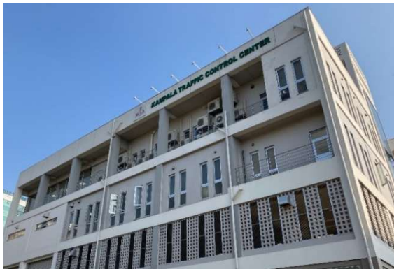
Traffic Control Center

Due to rapid urbanization and population growth, traffic congestion has become a serious social issue in Kampala, significantly affecting economic activity and the lives of citizens. Our company has been developing a traffic control system based in Uganda Branch Office established in July 2024. We will contribute to the realization of sustainable and safe urban transportation in Uganda by enhancing traffic flow control to alleviate traffic congestion and prevent accidents.