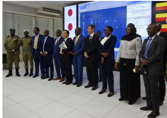
The opening ceremony